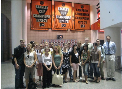
PRSSA members taking a tour of Comcast Spectacor in Philadelphia.

The Public Relations Student Society of America (PRSSA) is a pre-professional organization for communications students who want to learn more about the public relations field, network with professionals and apply knowledge from the classroom to a real world setting.